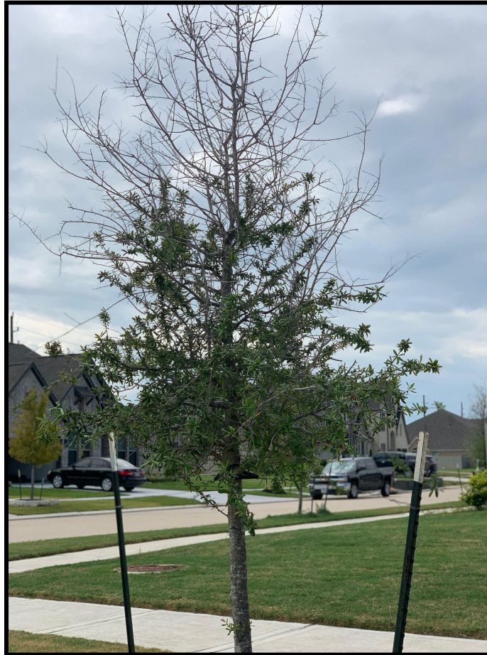
An example of dead wood that needs to be removed