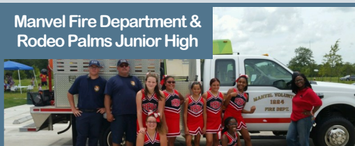
Manvel Fire Department & Rodeo Palms Junior High