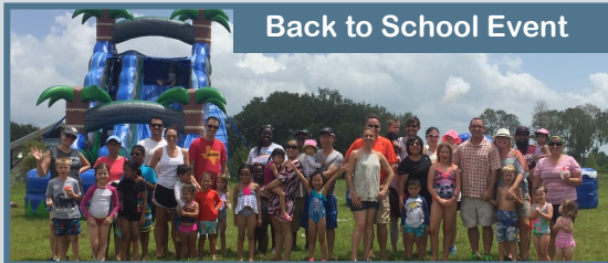
Back to School Event