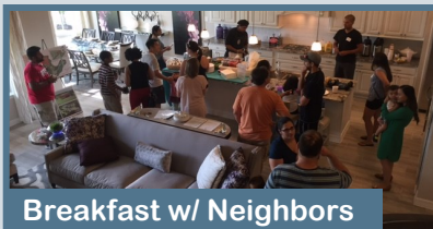
Breakfast w/ Neighbors