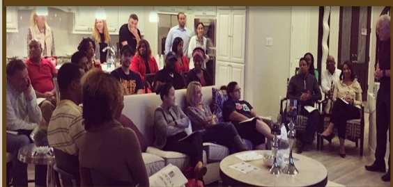
Gardening by the Moon