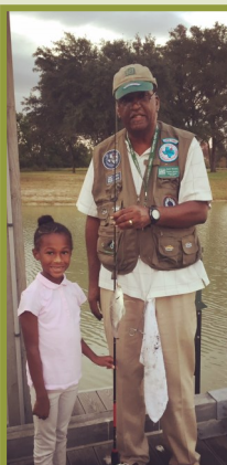
Fishing w/ Texas Parks and Wildlife Department